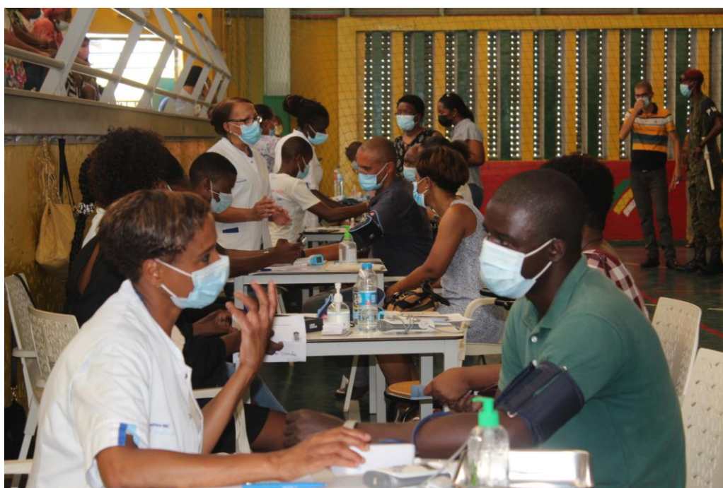
Photo: Vaccination photo at the Bairro Craveiro Lopes Vaccination Station