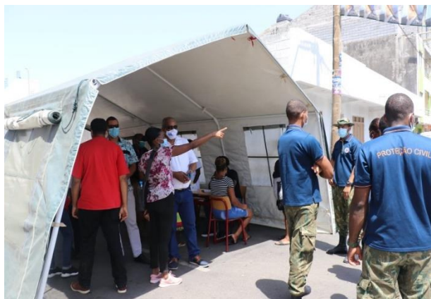
MS Santa Catarina